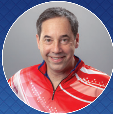
Parker Bohn III